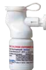
PPD-2 DPD Free Chlorine Dispenser

The HF PPD-2 DPD Dispenser is compatible with HF and many non-HF scientific photometers.