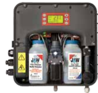
CLX Instrument cover removed

Hach® is a registered trademark of the Hach® Company, which is not affiliated with HF scientific.