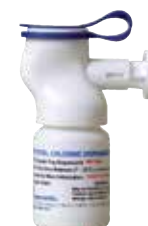
PPD-2 DPD Total Chlorine Dispenser