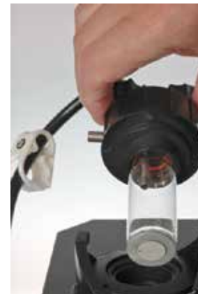
Ultrasonic autoclean system