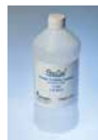
ProCal liter for Hach® 1720