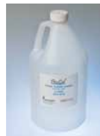
ProCal gallon for Hach® 1720

Standards certified* for use with the Hach® Company's 1720 series turbidimeters